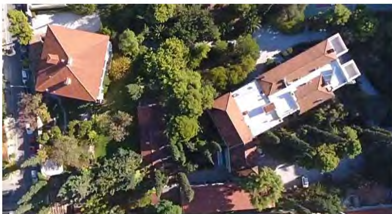
The BSA's Athens premises from above: Left: Upper House (aka Director's Residence); Right: Hostel & Library; Bottom: Fitch Laboratory