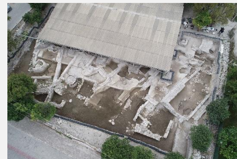
Left: Çeşme - Bağlararası