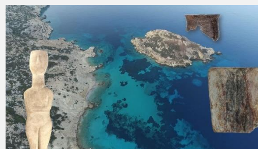
Above: The island of Keros with some of the excavation's finds.