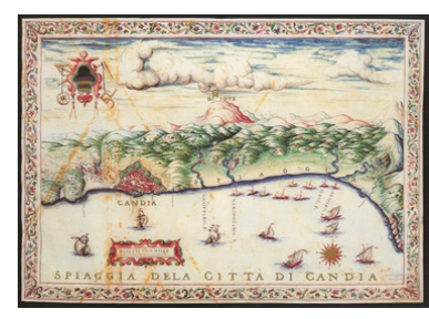
Spiaggia della Città di Candia, Francesco Basilicata, 1618