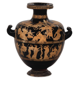
Red-figured water jar (hydria), signed by Meidias as potter