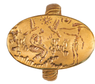
'The "Divine Couple" ring from Poros and the origins of the Minoan calendar'