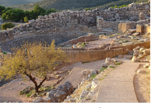
Mycenae Grave Circle A