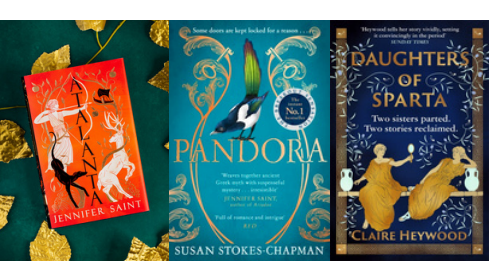
book covers courtesy of the authors