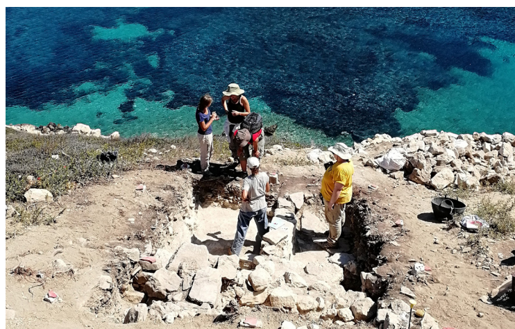
Keros excavations, 2018

Today the BSA is an institute for advanced research : we lead and collaborate in innovative research projects and international training networks. We conduct, facilitate and promote research of international excellence in all periods — from the Palaeolithic to the present — and across all humanities and social science disciplines in subjects as diverse as education, migration, society, economics and religion.