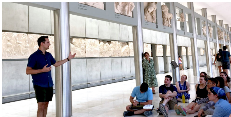
Teaching on site at the Acropolis Museum

Around 500 researchers and 1,000 students use our facilities annually and we hold several undergraduate and postgraduate courses annually. The BSA collaborates with over 100 institutions in the UK, Greece, throughout Europe, North America, the Middle East and Australia . This includes UK universities, other foreign schools in Athens, and universities throughout Greece.