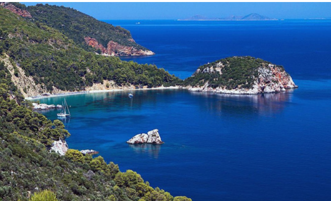
View of the Staphylos peninsula, Skopelos