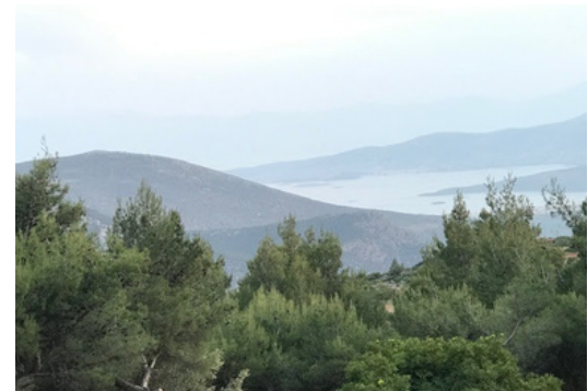
Delphi