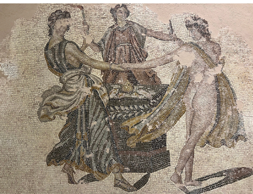
Mosaic pavement showing the Horae from a villa in Patras. 2nd – 3rd c. CE. Archaeological Museum of Patras